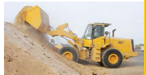
Photographs are representations only. Actual options will vary by model and application.