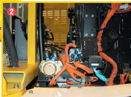
Photographs are representations only. Actual options will vary by model and application.